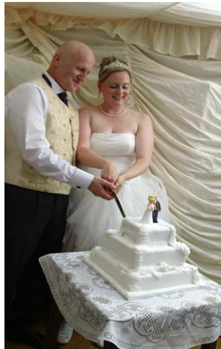
Cutting the cake